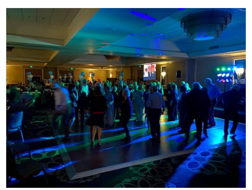
RBers rock away the evening to the tunes of TJ the DJ.