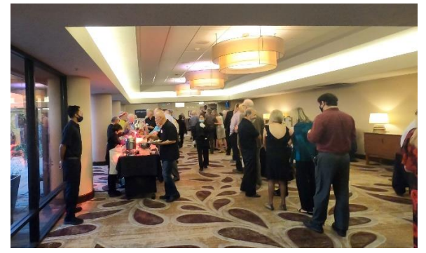
The buffet style dinner was all about the luck of the draw. Dinner tables were numbered and asked to the buffet line five tables at a time. Sorry, no dessert left!